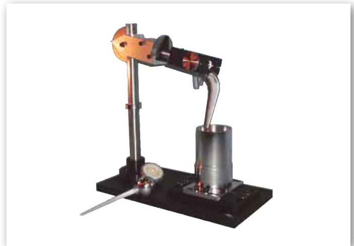
The embedding fixture ensures correct implant alignment for the test